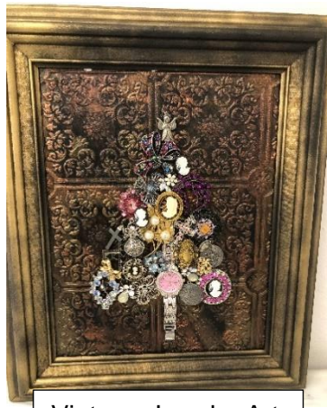
Vintage Jewelry Art