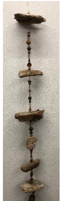
Driftwood Beaded Bell or Wind Art