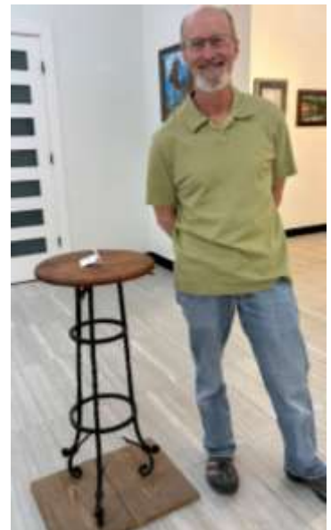
Metal art by Troy Chafin