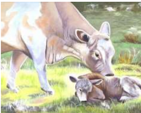
Painting by Sue Pape