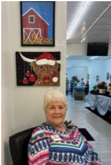
Acrylic Paintings by Betty Mullholland