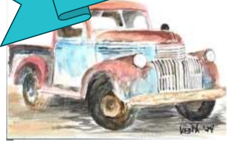
Watercolor by Verna Lenth