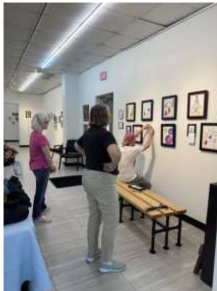
Getting it all done thanks to the artists / volunteers