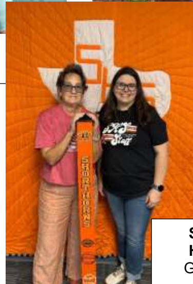
Schulenburg High School. Go Shorthorns!