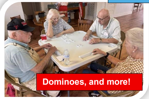
Dominoes, and more!